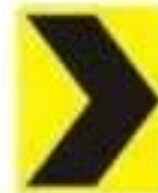
CHEVRON SIGN 138