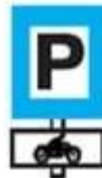
PARKING LOT SCOOTER & MOTOR CYCLE