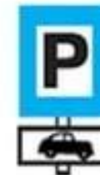
PARKING LOT CARS