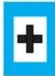
FIRST AID POST