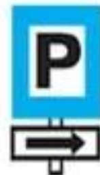
PARK THIS SIDE