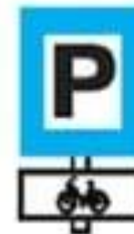
PARKING LOT CYCLE