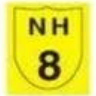
ROUTE MARKER 139